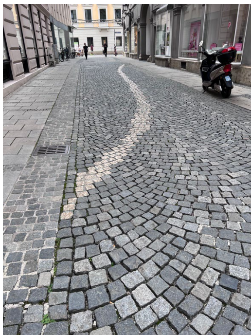
The path many Jewish women took on Viscardigasse in Munich to avoid having to salute the Nazi guards at Military Commanders' Hall