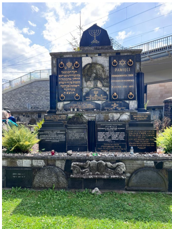
Broken headstones used to build a memorial in Krakow's New Jewish Cemetery