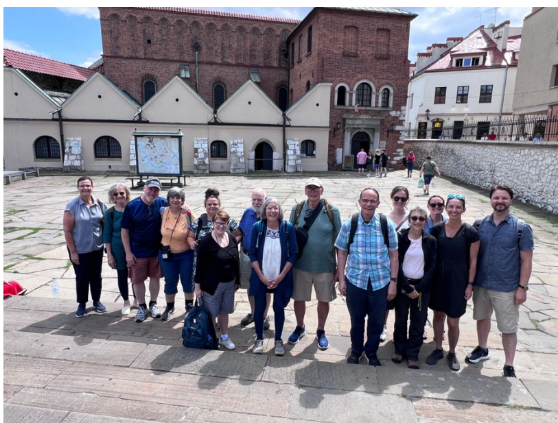
The group standing in front of The Old Synagogue in Krakow